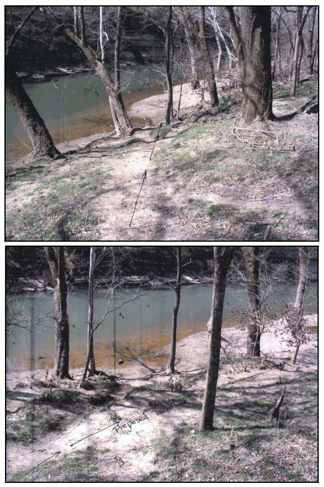
Figure 2: Photos of the existing site conditions