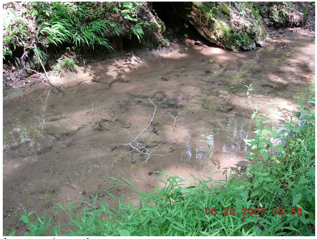
downstream impacted segment