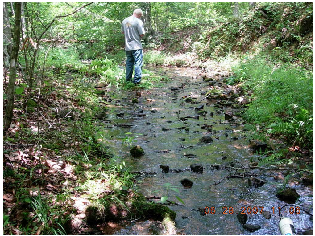
upstream un-impacted stream segment