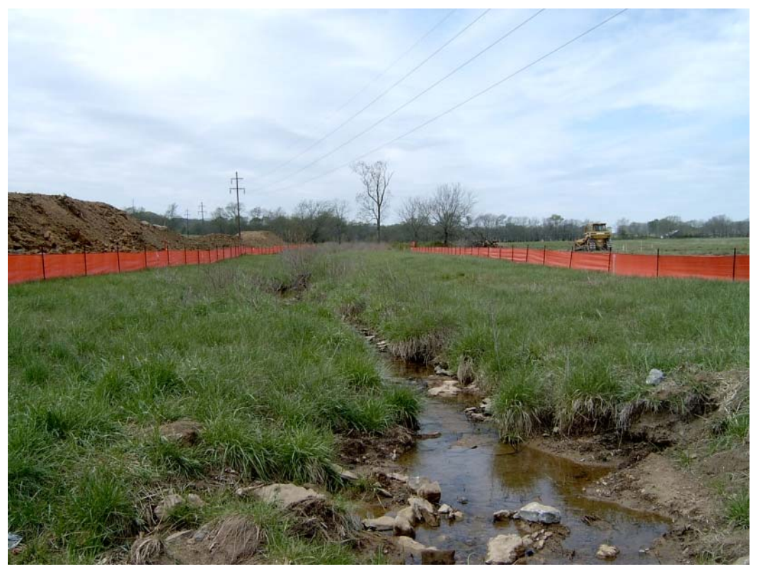
Riparian buffer restoration. N: 36.37939° W: 86.56136°