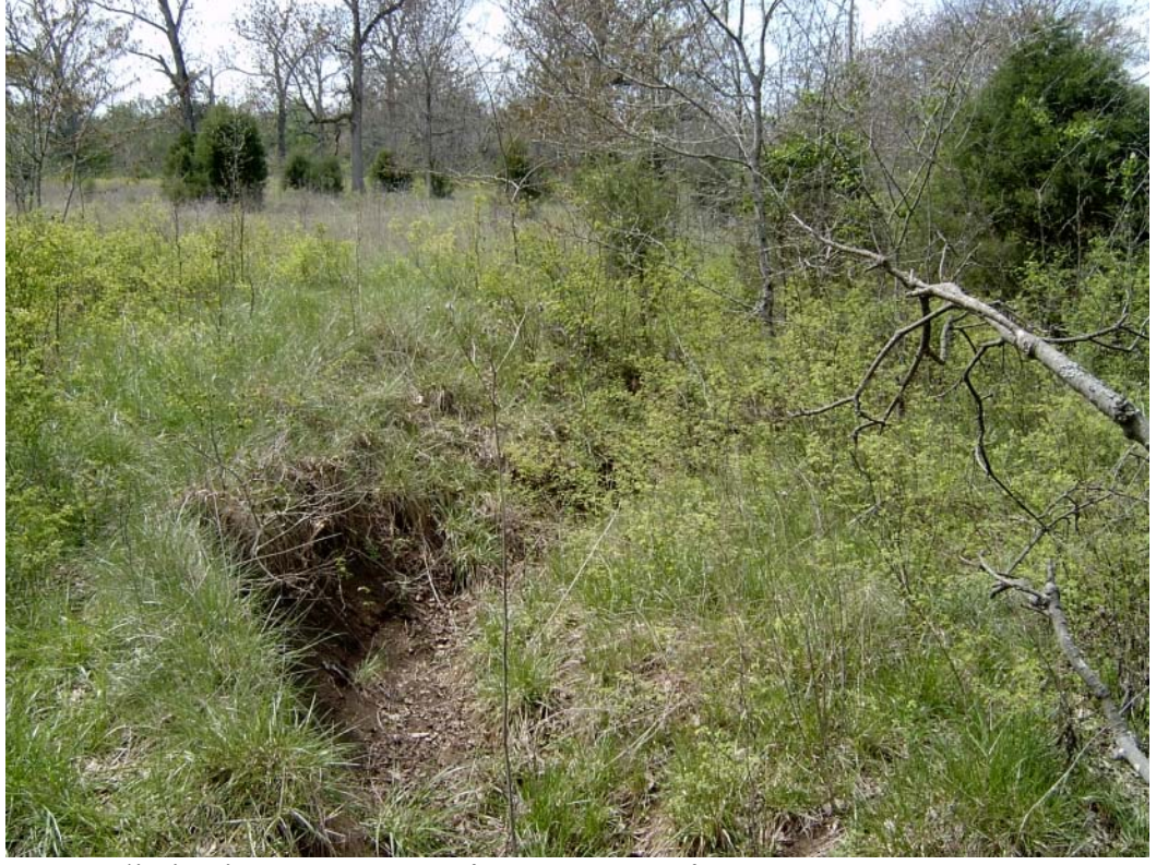
Stream elimination. N: 36.37570° W: 86.55992°