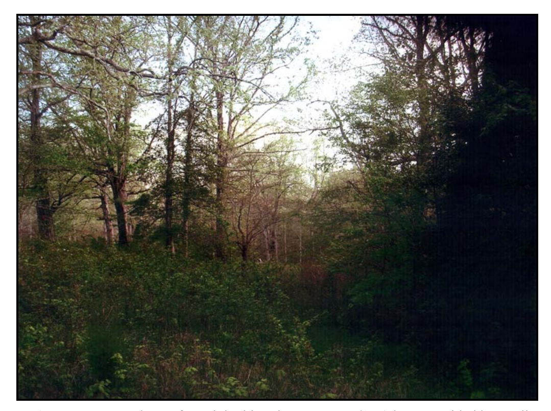
Photo 2 : From proposed top of pond, looking downstream 5/07