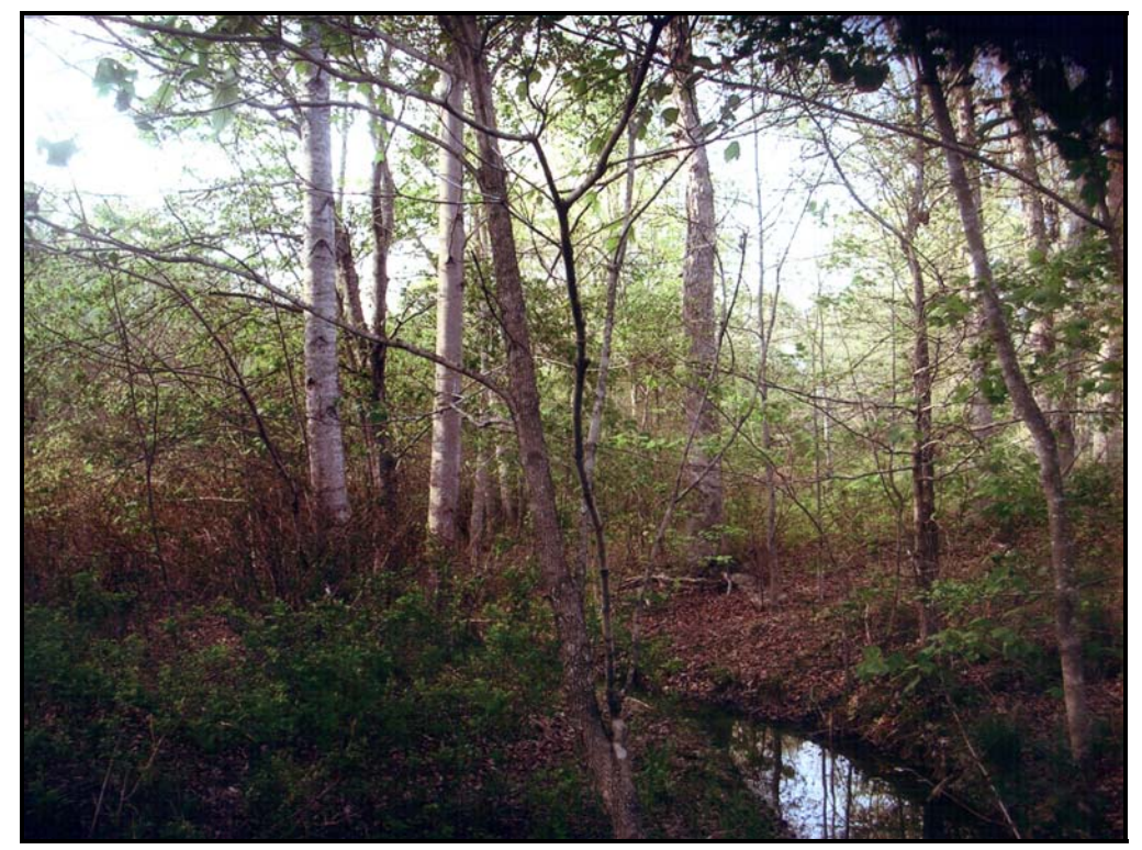
Photo 1 : From proposed dam site looking upstream 5/07