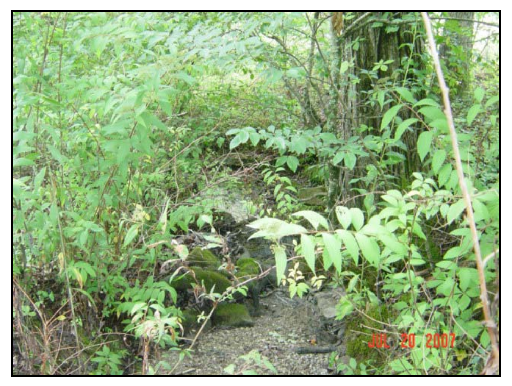
Photo 3: Typical substrate in proposed impoundment zone