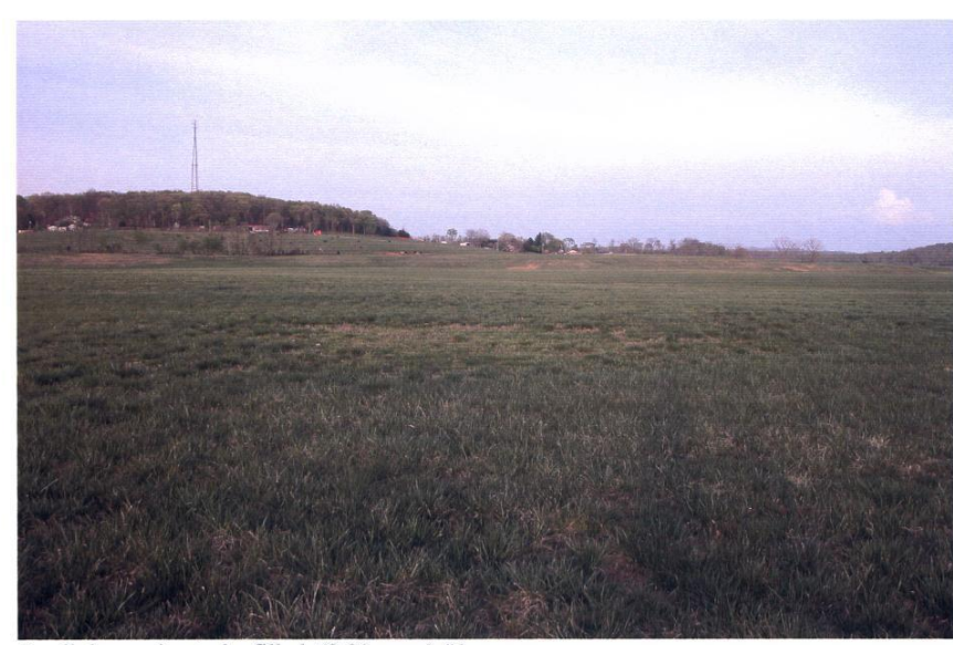
Small depression to be filled. (0.01 acres) #1