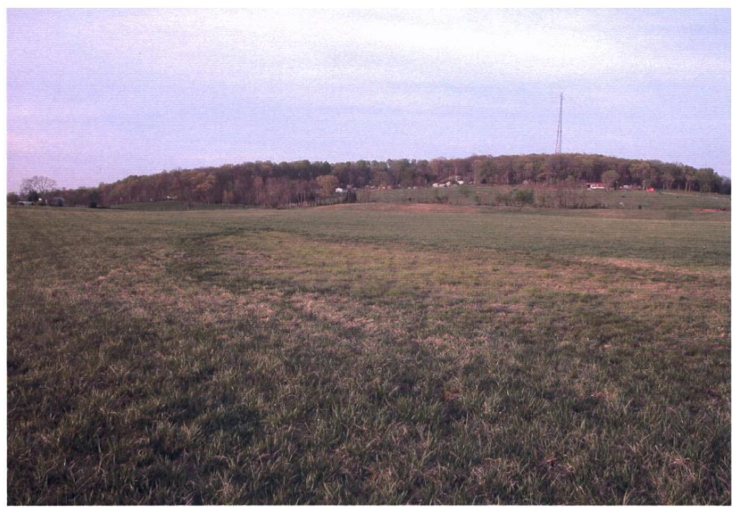
Intermediate depression to be filled. (0.54 acres) #1