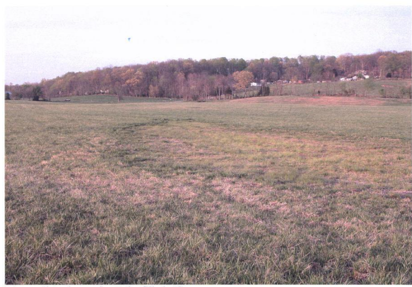
Intermediate depression to be filled. #2