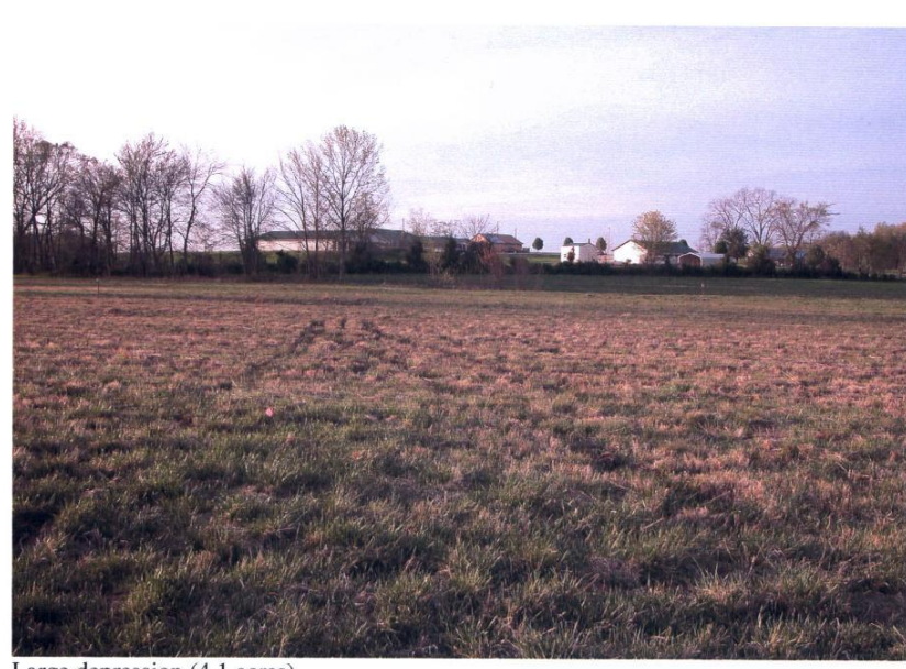
Large depression (4.1 acres).