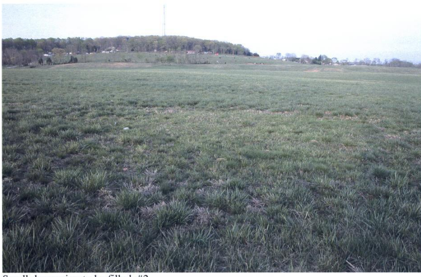
Small depression to be filled. #2