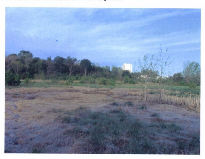
Photo 2: Alternate view of isolated wetland, photo looking northwest.