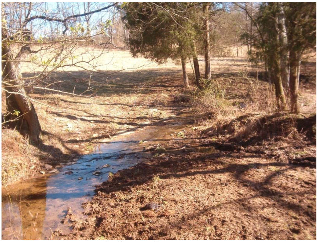
Stream segment at road and utility crossing