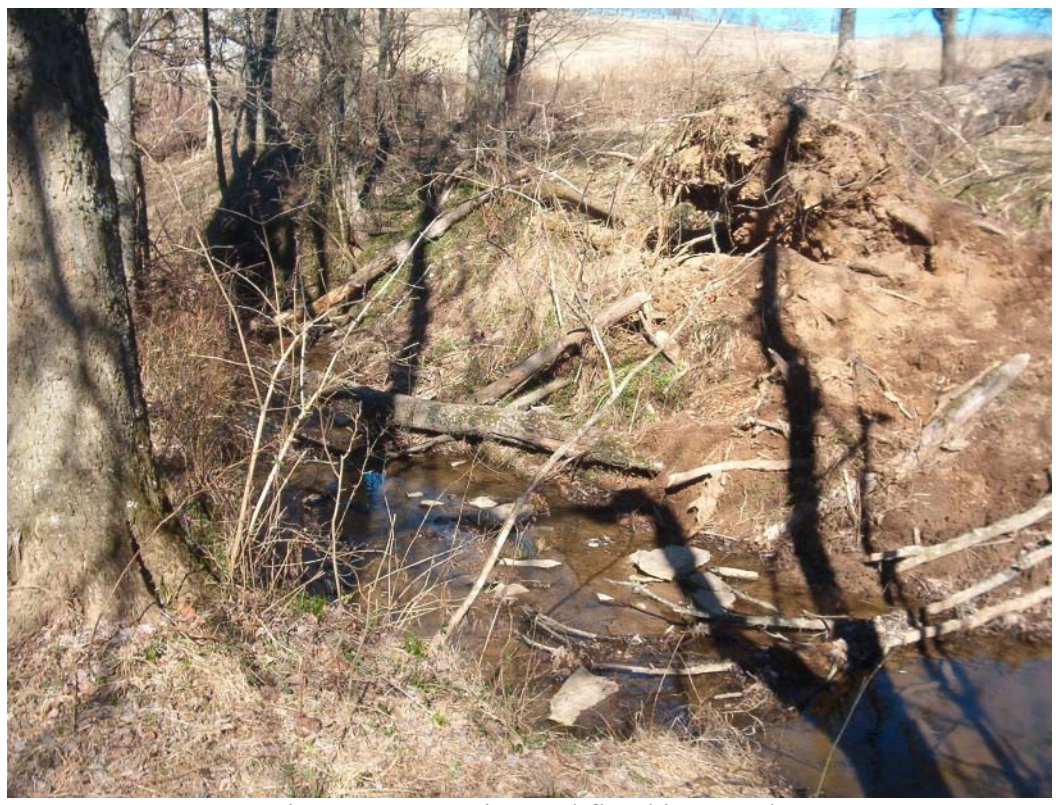
Stream segment at maintenance crossing and flood impoundment