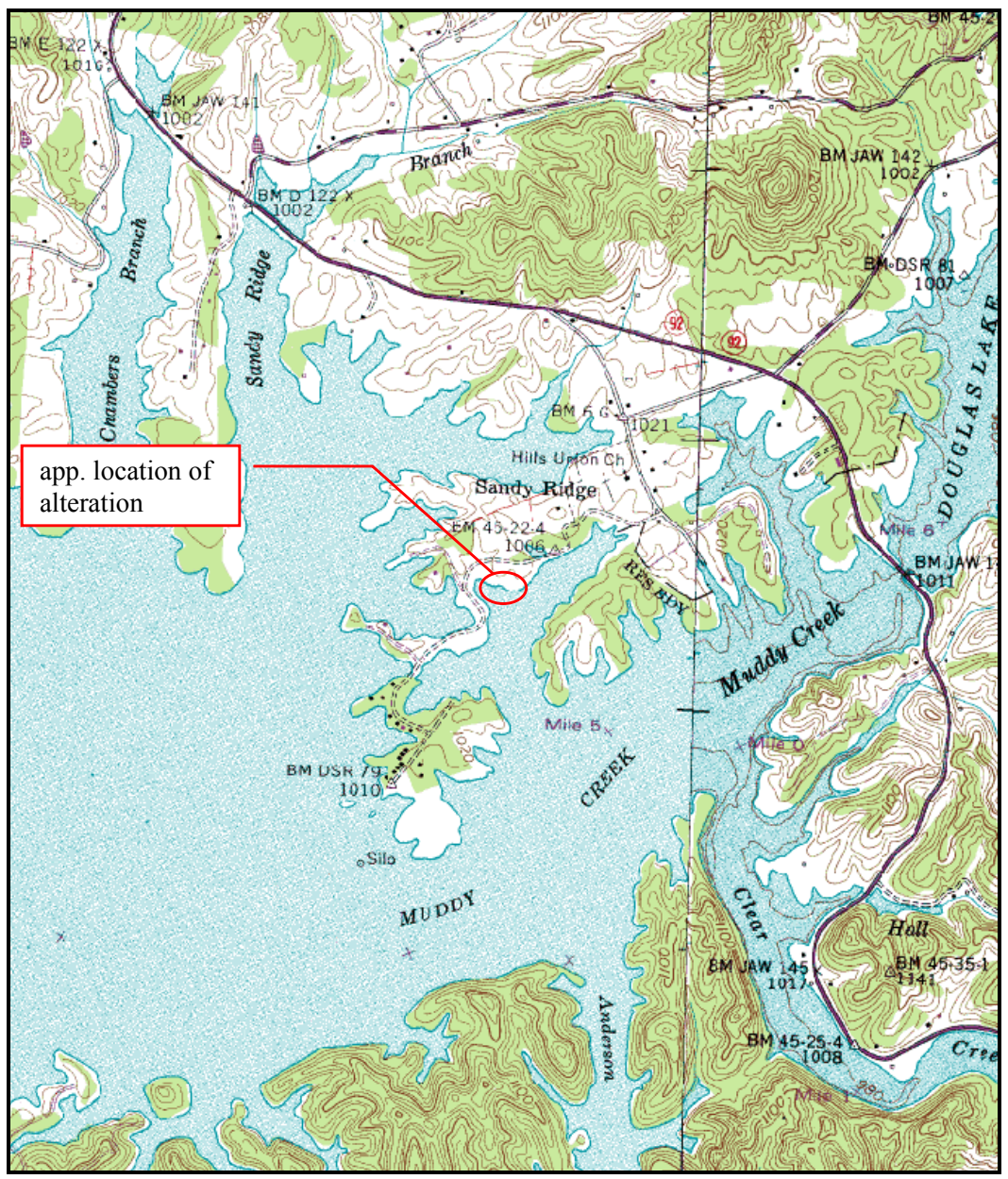
Figure 1: Approximate location of proposed excavation

In deciding whether to issue or deny a permit, the department will consider all comments on record and the requirements of applicable federal and state laws.